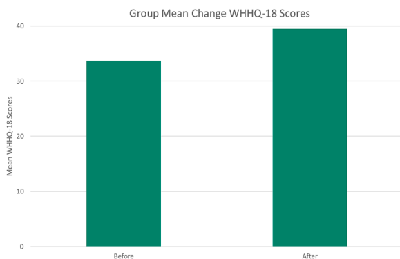
Fig. 2. Group mean change WHHQ-18 scores.

employed. To our knowledge this is one of the first studies to be published about Long Covid combining psychoeducation and mind-body complementary approaches within a community setting.